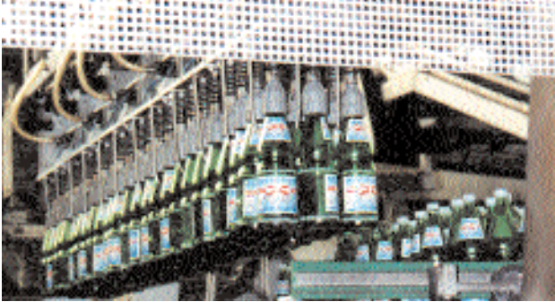
Crates are quickly and economically emptied and refilled with the aid of compressed air

than glass. Consumers also are increasingly coming to appreciate the advantages of PET bottles and show their preference. Furthermore, the bottles can be reused or recycled with little energy expenditure.