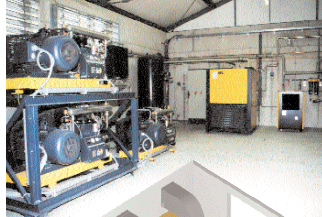
The compressed air installation with high and low pressure stages for PET bottle production at Güssinger Mineralwasser GmbH