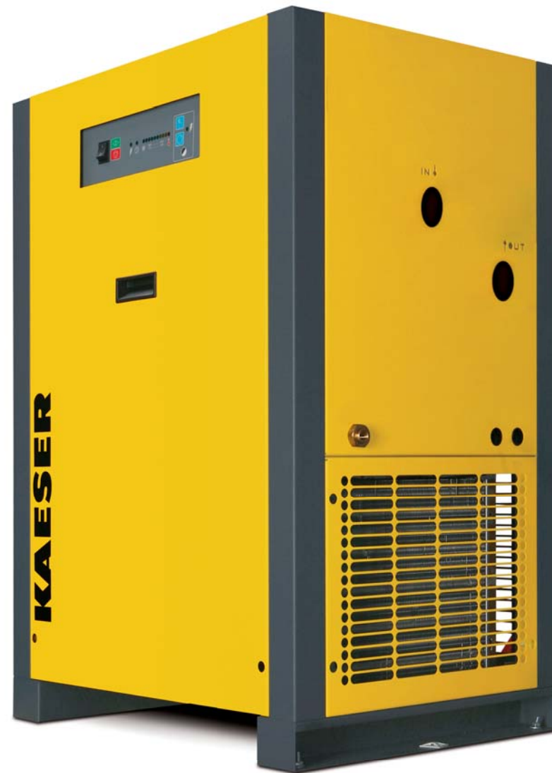
Standard version THP 40-50